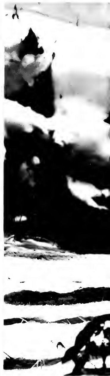
Grizzly bear: Conrad Rowe